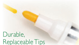
Durable, Replaceable Tips