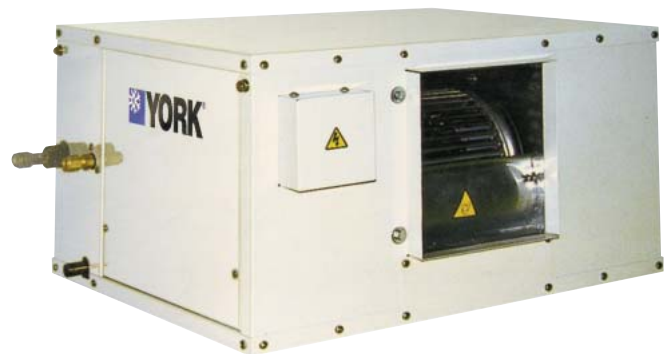
MBC-MBH 25 to 65